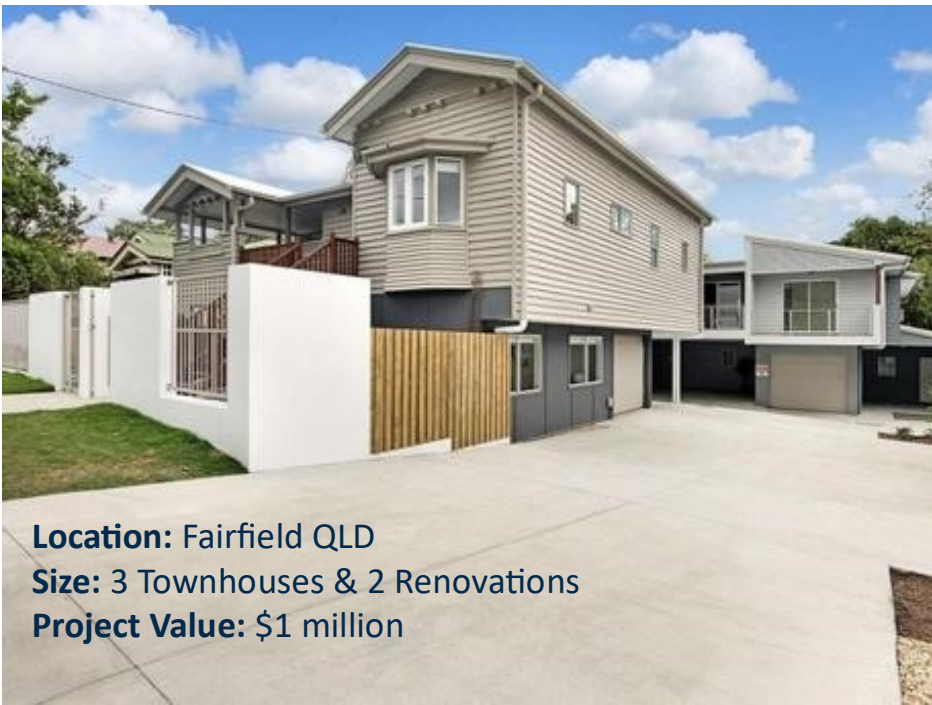
Location: Fairfield QLD Size: 3 Townhouses & 2 Renovations Project Value: $1 million