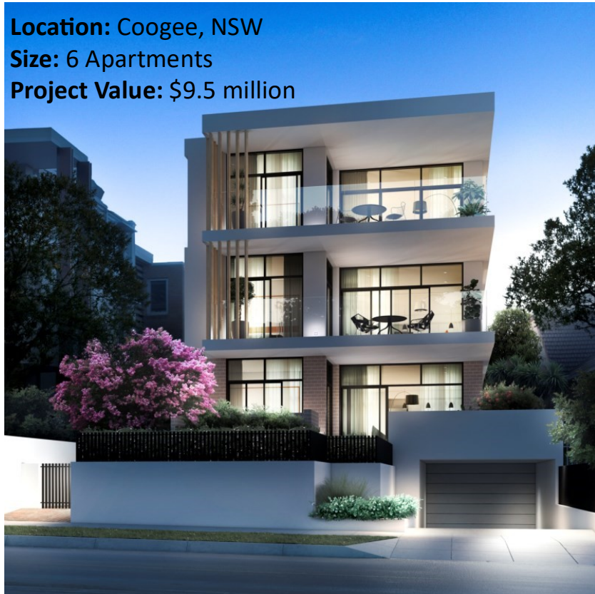
Location: Coogee, NSW Size: 6 Apartments Project Value: $9.5 million